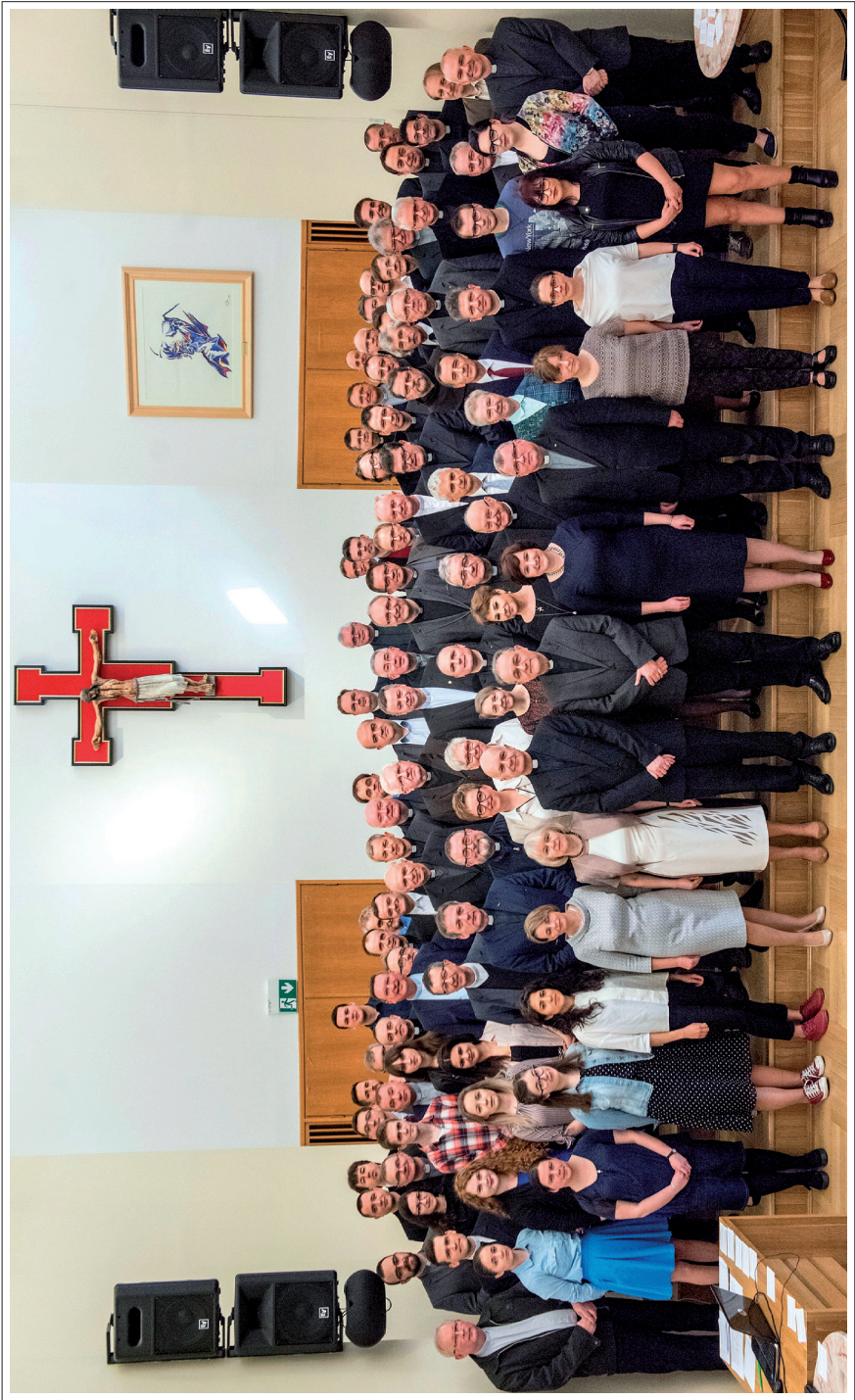
Faculty of Theology Council, 10 April 2018.