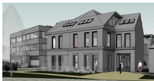
Fig. 23 Extension project of the Faculty of Health