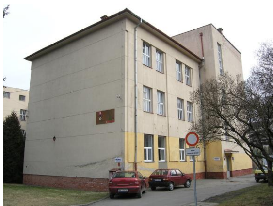
Fig. 1 Headquarters of the Faculty of Health of the Catholic University located in the premises of the Central Military Hospital of the Slovak National Uprising in Ružomberok since 2005

on the development of education and scientific research within accredited study programs. The programs were designed in a modern way and were fully compatible with similar international programs. The faculty had to be built and developed in terms of both personnel and material-technical resources. The content and ideological concept of the faculty was structured to prepare graduates for professional healthcare work in modern society. It was necessary to establish individual departments, equip lecture halls, classrooms, libraries, information networks, and other workspaces with the necessary infrastructure. The faculty's activities became an integral part of the long-term strategy of the Catholic University and its development in the context of society's needs. The faculty subscribed to Christian morality, academic freedom, and the equality of all people. In this spirit, the education of students has taken place and continues to this day.