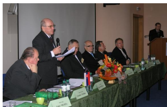
Fig. 5 1st Annual Ružomberok Healthcare Days Conference – 2006