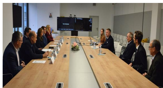
Fig. 13 Opening of the 16th online edition of Ružomberok Healthcare Days

In 2022, the 16th edition of the Ružomberok Healthcare Days was held, featuring leading experts from both domestic and international institutions. The scientific program was divided into six thematic sections and included 71 professional presentations.