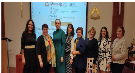
Fig. 20 Faculty of Health lecturers at a professional event

Additionally, the Faculty participated in several national KEGA research projects focused on promoting health literacy and nutrition among at-risk patients. The results were presented through seminars, workshops, and a poster session in October 2023.