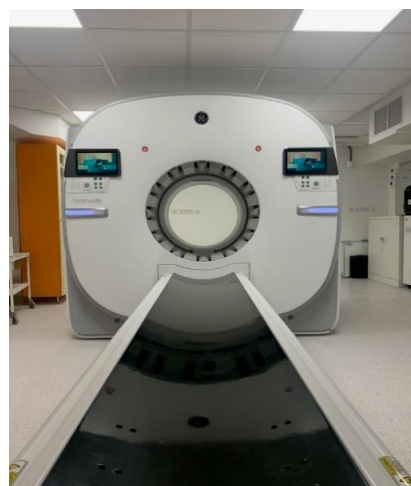
Fig. 21 New medical equipment at the Clinic of Nuclear Medicine (Starguide gamma camera) in the Central Military Hospital SNP Ruzomberok–Teaching Hospital

advancement of both institutions. Planned projects for the near future involve the redevelopment of infrastructure for both the hospital and the faculty. These include the renovation of surgical and internal medicine pavilions, the construction of an oncology center with a cyclotron and nuclear medicine complex. The Clinic of Nuclear Medicine has already been upgraded with new equipment. The Faculty of Health is preparing documentation for a project to expand into new premises on Andrej Hlinka Square. All these plans remain visions, and—as in the past—their realization is ultimately in God's hands.