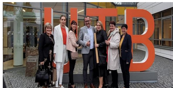
Fig. 17 Participation of Faculty of Health lecturers at the conference in Zlín

In 2024, the Faculty of Health co-organized the 14th edition of the conference “ Family – Health – Illness ” in Zlín, together with Tomas Bata University in Zlín and its Faculty of Humanities.