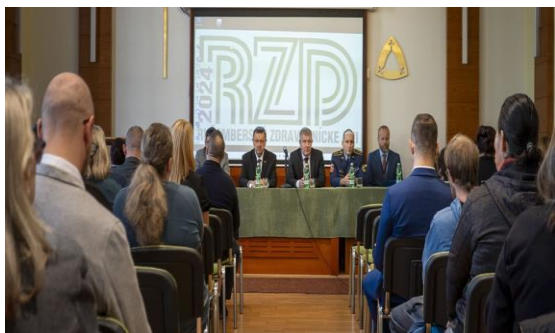
Fig. 19 Opening of the 18th edition of Ruzomberok Healthcare Days (November 2024)