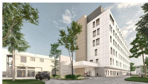
Fig. 22 Project of the new “Oncology Center” at the Central Military Hospital SNP Ruzomberok–Teaching Hospital