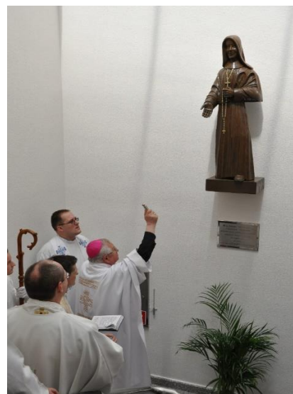
Fig. 11 Consecration of the Faculty of Health to Blessed Sister Zdenka

The Faculty of Health strives to intensify international mobility for students and teachers, especially with universities in the Czech Republic, Poland, Spain, and Slovenia. The faculty actively seeks to participate in scientific projects at both national and international levels. One of the faculty's key missions is to support student scientific and professional activities. A continual priority is the improvement of material and technical infrastructure.