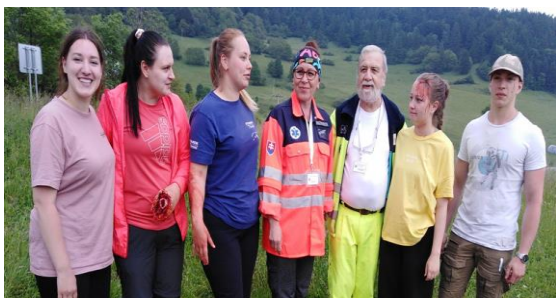
Fig. 15 Participation of students from the Faculty of Health, Department of Emergency Medical Care, in the MUDr. Jann Kovalcik Memorial

Students of the Faculty of Health of the Catholic University participated in a rescue competition. The 12th edition of the MUDr. Jan Kovalcik Memorial was held in the cadastral area of the village of Lipovce. Among the members of both competing and winning teams were several graduates of the bachelor's study program Emergency Medical Care .