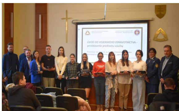
Fig. 16 Awarding of healthcare students – graduates of the specialized military course, with representatives of the Faculty of Health and the Central Military Hospital SNP

In the 2022/23 academic year, lectures in the specialized military subject Introduction to Military Healthcare were launched during the summer semester. The course was met with positive feedback and concluded with a ceremonial awarding of students, attended by representatives of the Central Military Hospital Ružomberok–Teaching Hospital and the leadership of the Faculty of Health.