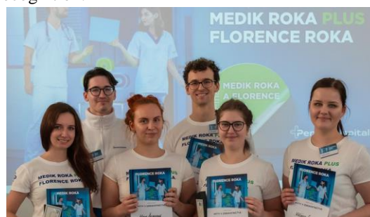
Fig. 14 Participation of Faculty of Health students in the “Florence of the Year” competition

Students of the Faculty of Health regularly participated in professional competitions. In 2023, they represented the faculty in the “Florence of the Year” competition, where they gained valuable practical experience and received professional recognition.