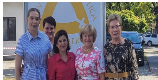
Fig. 18 Visit from Poland

In September 2024, the Department of Nursing welcomed Polish experts from Białystok and Jarosław, who presented joint research focused on the issue of workload and burnout syndrome among nurses.