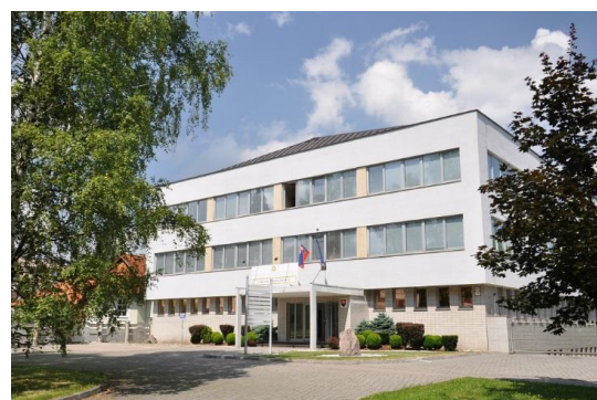
Fig. 10 New building of the Faculty of Health, Catholic University in Ružomberok